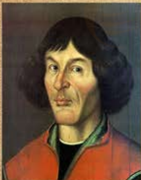
Nicolaus Copernicus - Astronomer (1473–1543)

The Empress of Russia, wife of Nicholas II (from 1894). She was the fourth daughter of Grand Duke Louis IV of Hesse and Rhine and Duchess Alice, daughter of Queen Victoria of Great Britain. In 1981, Alexandra Feodorovna and all members of the royal family were canonized by the Russian Orthodox Church.