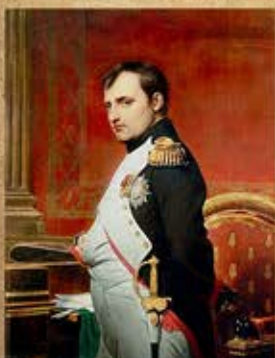
Napoleon I Bonaparte - Emperor (1769–1821)

Polish astronomer, mathematician, mechanic, economist, and canon of the Renaissance era. He is best known as the author of the heliocentric model of the universe, which laid the foundation for the first scientific revolution.