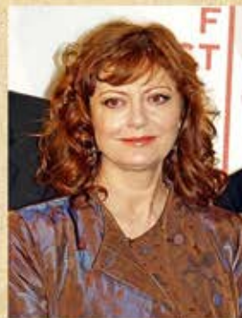
Susan Sarandon - Actress (October 4, 1946)

Husband of Queen Elizabeth II of the United Kingdom. Philip is a great-grandson of King Christian IX of Denmark, a great-great-grandson of Queen Victoria of England, and a great-great-grandson of Russian Emperor Nicholas I. He was baptized in the Greek Orthodox faith.