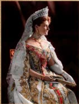
Alexandra Feodorovna - Tsarina (1872 – 1918)

The Empress of Russia, wife of Nicholas II (from 1894). She was the fourth daughter of Grand Duke Louis IV of Hesse and Rhine and Duchess Alice, daughter of Queen Victoria of Great Britain. In 1981, Alexandra Feodorovna and all members of the royal family were canonized by the Russian Orthodox Church.