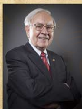
Warren Buffett - Entrepreneur (August 30, 1930)

American film actress and Academy Award winner, Susan Sarandon became renowned for her roles after turning forty. Throughout the 1990s, she was nearly annually nominated for an Oscar for Best Actress, for her performances in films like Thelma & Louise , Lorenzo's Oil , and The Client . She won the award for her role in Dead Man Walking (1995).