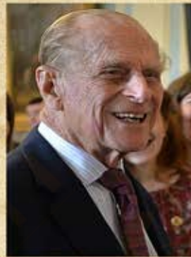
Philip - Duke of Edinburgh, Prince (1921-2021)

Husband of Queen Elizabeth II of the United Kingdom. Philip is a great-grandson of King Christian IX of Denmark, a great-great-grandson of Queen Victoria of England, and a great-great-grandson of Russian Emperor Nicholas I. He was baptized in the Greek Orthodox faith.